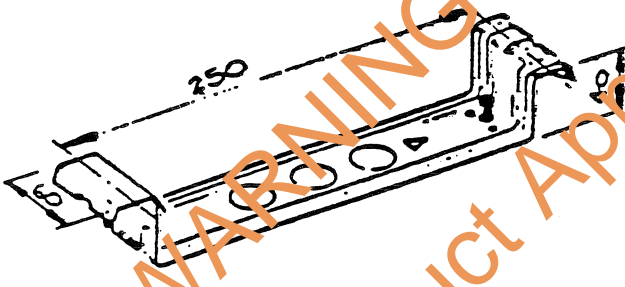
Sundeck Mk II Fixing Strap